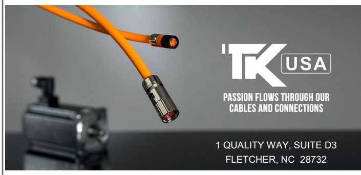
TK USA is the US headquarter of Italian/German TK Group. The parent company TecniKabel (TK) is located in Volpiano, near Turin Italy.

in business since 1978 and is one of the leading manufacturers of servo, motor supply and motion control cables for automation. Advanced manufacturing technologies and a strong focus on engineering enable TK to supply specialty and custom cables suitable for many applications. TK will be making cable assemblies at their facility in Fletcher once they are fully settled in here.