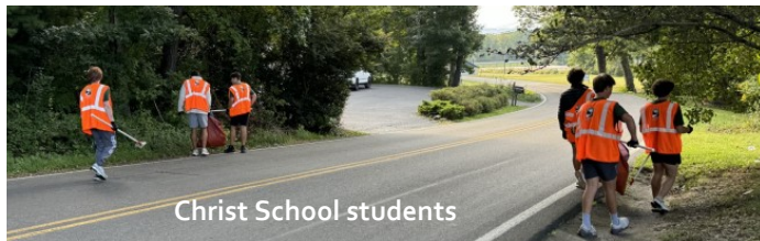
Christ School students