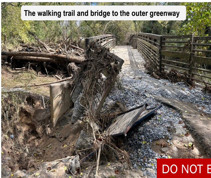
The walking trail and bridge to the outer greenway