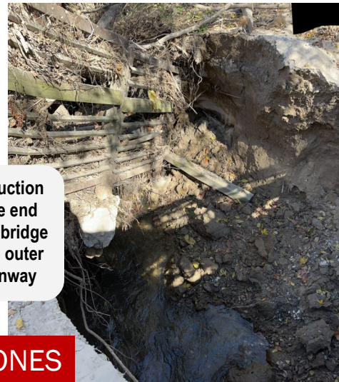
Destruction at the end of the bridge to the outer greenway