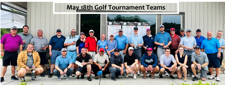
May 18th Golf Tournament Teams

We are offering 6-week "Introduction to Pickleball" clinics for adults and youth beginning June 10th. The Youth clinic still has a few available slots, so register now at https://fletcherparks.recdesk.com/Community/Home . Look for more classes in the Fall if you are interested in learning the basics of this sport.